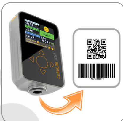
Integrated QR- and BAR-Code scanner for sample ID and name

The small sized instrument, made in Germany from a solid aluminium block, weighs just 270g. It is equipped with the latest high-definition technology allowing a high resolution spectral scan in 3.5nm steps in less than 1 second. The brilliant colour high contrast O-LED display makes a perfect user interface. The menu is simple and clear, so anyone can perform measurements fast and accurate. A further unique feature of the ColorLite XS1 is the integrated data-matrix bar-code camera. This allows for fast effect sample identification and management.