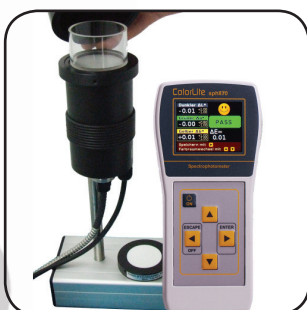
Measuring set inhomogeneous samples

The sph870 is a user-friendly, portable spectrophotometer with a 45^{\circ}/0^{\circ} geometry, which due to the wide range of accessories available is suitable for a variety of surfaces and materials. For example, the system can be easily changed from the 45^{\circ}/0^{\circ} to a d/8^{\circ} geometry simply by using our MA35 probe head adapter. The high-resolution technology enables a spectral scan in 3.5 nm steps in just 0.5 seconds. The menu is simple and well arranged, so that even untrained staff can perform the measurement task fast and accurate.