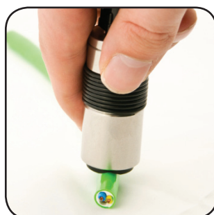
Probe head with v-block for cylindrical samples