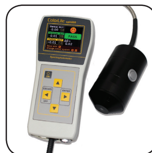
sph870 with measuring head MA35