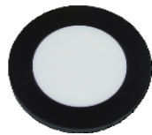
White certified calibration standard

To calibrate the device use a certified white calibration reference. We recommend to calibrate the device before using it or before measuring a colour standard. To calibrate, you must first start ColorDaTra on your PC. Then place the black reference with the measuring cuvette (if applicable) over the measuring aperture and select - Calibrate -. After the dark measurement, carry on the measurement with the white standard. Follow the instructions on the PC. Place the calibration standard on the measuring port and click on "ok".